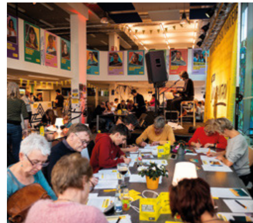
Letter writing event in Antwerp, Belgium, for Write for Rights 2022.

HAVE THE SPACE required for them to engage emotionally and develop their own attitudes.